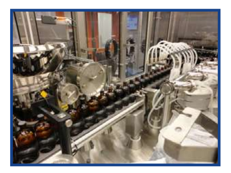
Line 10: Stopper Station Caps and seals vials